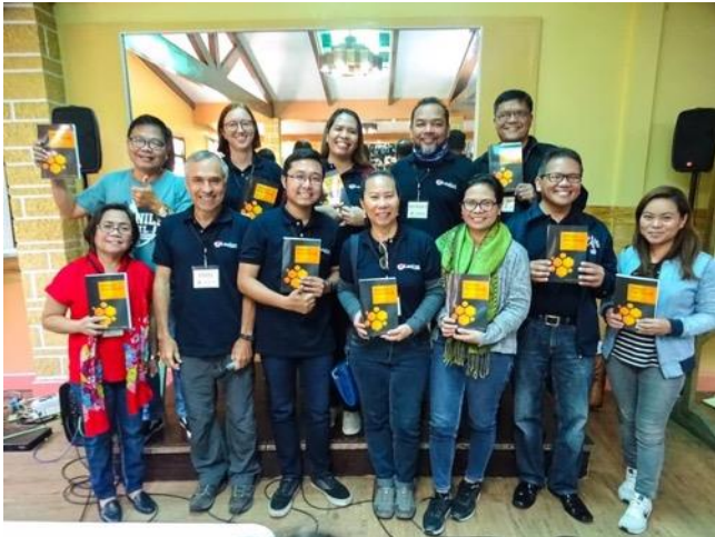
Langham National team